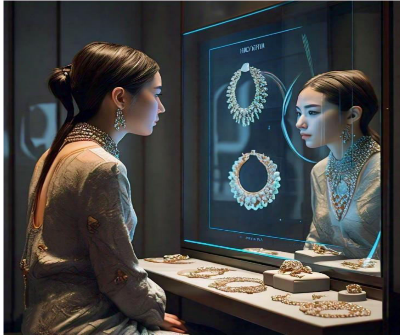
Fig. 2. Example output

Face and Body Detection: By using the camera feed and advanced computer vision algorithms (like those in MediaPipe), the system identifies key facial landmarks to understand the user's face orientation and position.